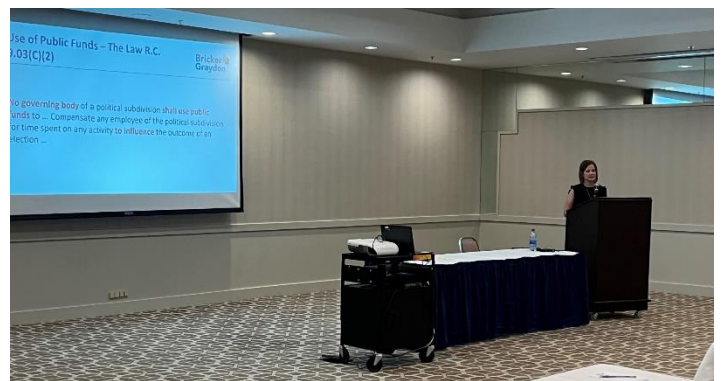
Nicole Donovan from Bricker Graydon on the civil track side with a presentation on the limitations on levy and bond campaign activities.

More pictures can be found on our Twitter (or "X" now) account.