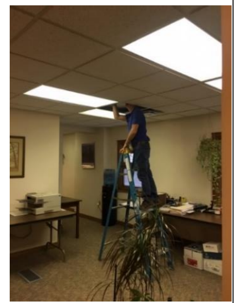
Otherwise, not much happening in downtown Columbus, let alone at OPAA Corporate. We are managing to keep the plants alive.

plus years finally decided to give up the ghost. Mid-Ohio Heating and Cooling has been mapping the building for our new system.