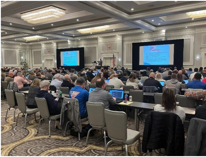
A full house for the Criminal Prosecutor track was the norm for both days