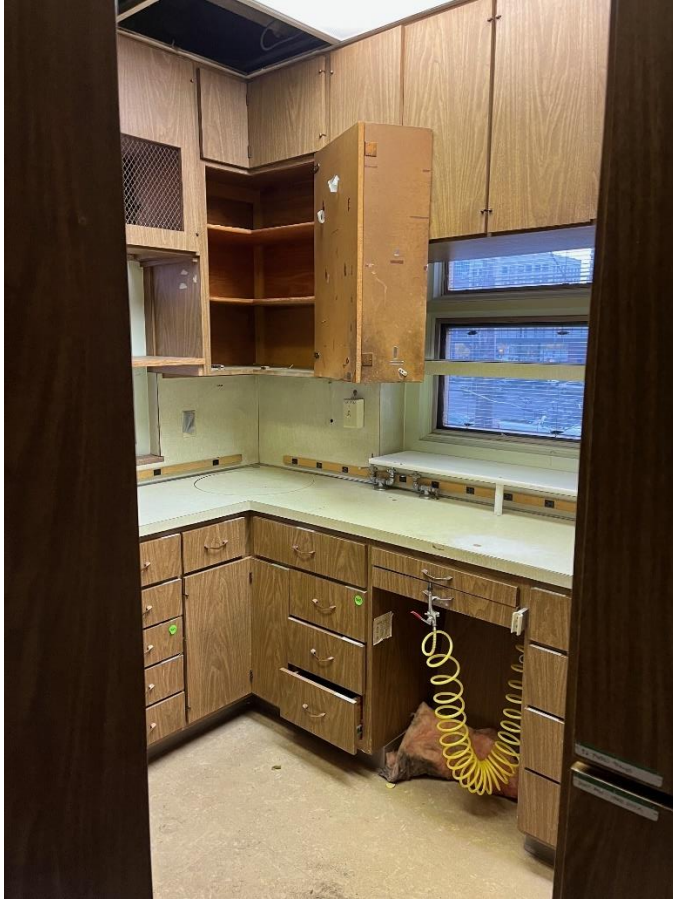
Dental lab before and after

Demolition has started on our third floor space that will be housing the Ohio Network of Childrens Advocacy Centers corporate office. They anticipate an August move-in.