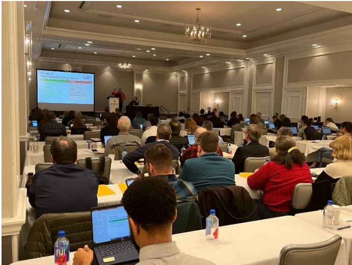
The Civil Prosecutor track was full both days as well!